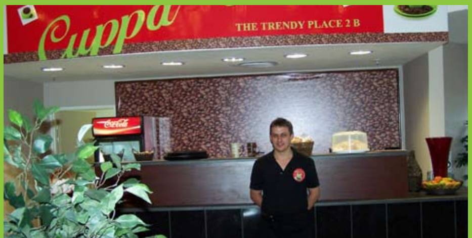
Visit Etienne at Cuppa-Cino "The trendy place 2 B"

Grab a cuppa from CUPPA-CINO coffee shop which recently opened in the Movie Zone foyer. It also offers great food at great prices. Cuppa-cino is a wonderful, trendy venue to enjoy a delightful cup of coffee!