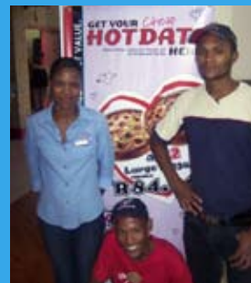
Staff at Roman's Pizza advertising their Hot Date Special

We would like to congratulate the staff at Roman's Pizza for receiving an excellent evaluation report for January 2010. They achieved a 93% rating exceeding their target. WELL DONE!